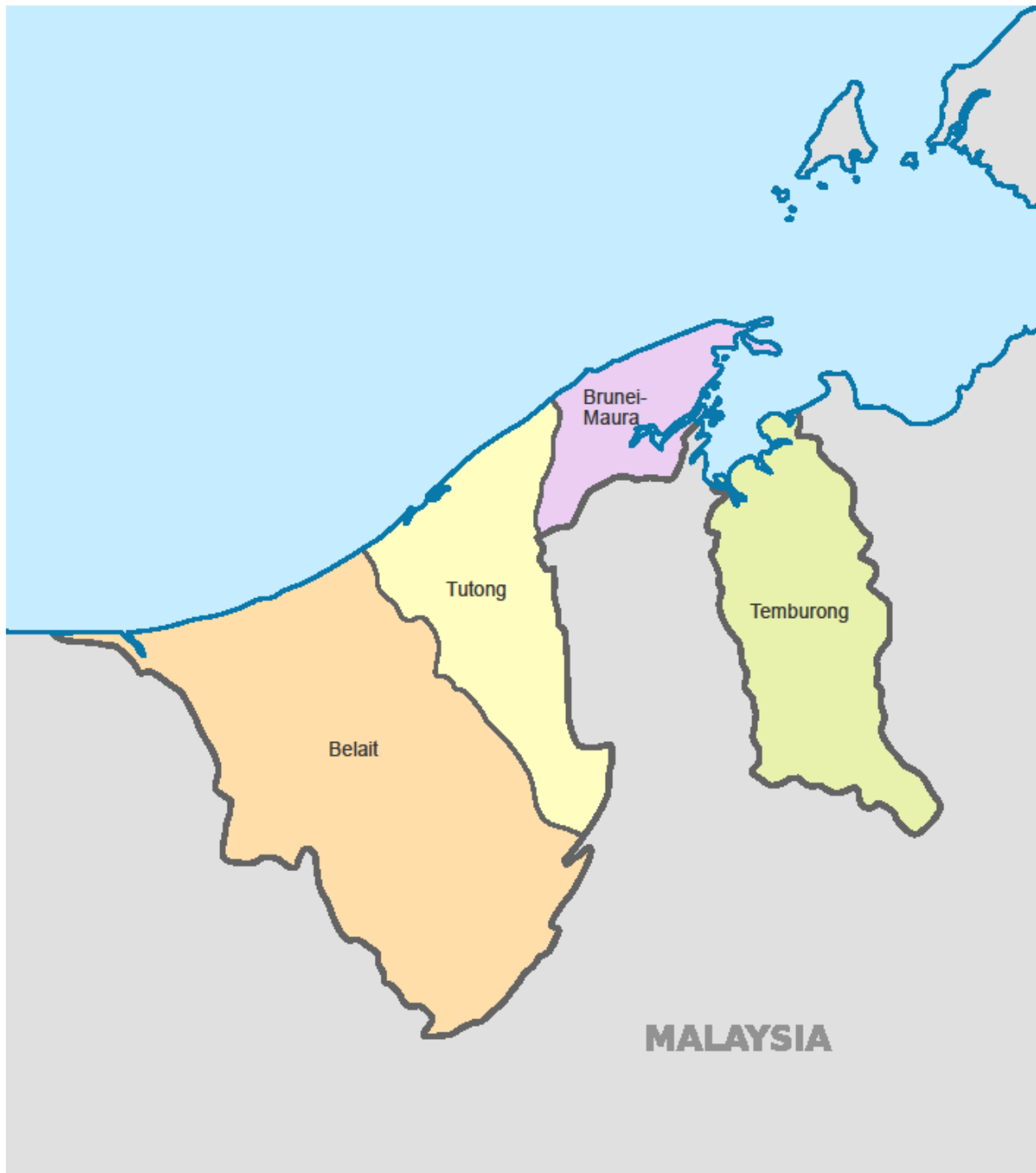
Figure 1: Map of Brunei and surrounding area

The national language is Malay, and, as Malays comprise 73.5% of the population, 25 it is likely that the practice of FGC is widespread in the country.